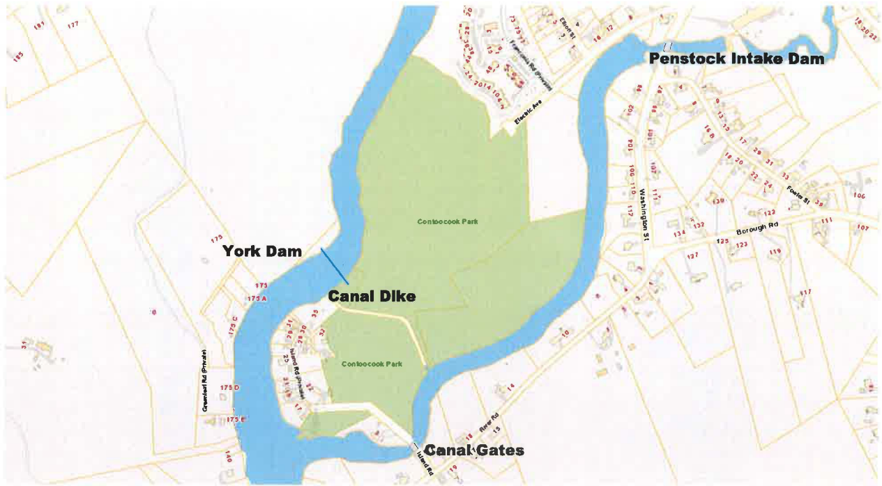
Figure 3. Municipal Tax Map