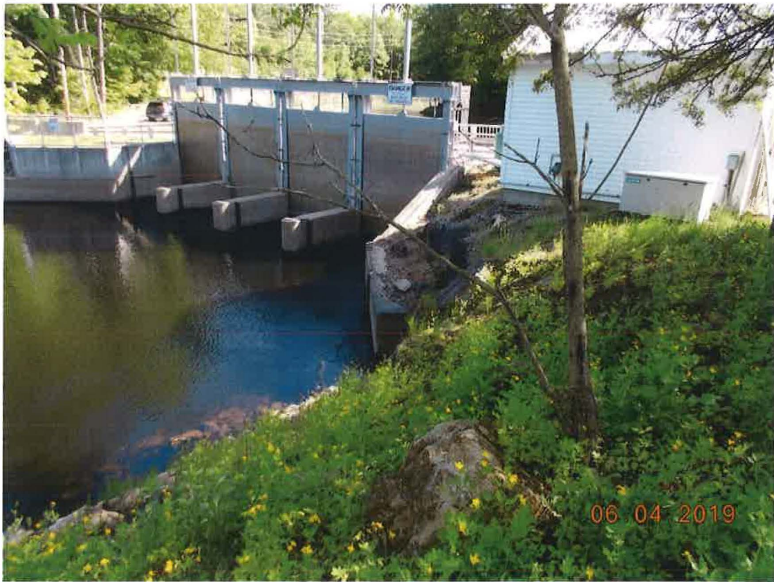
Figure 6. Rolfe Canal Gates