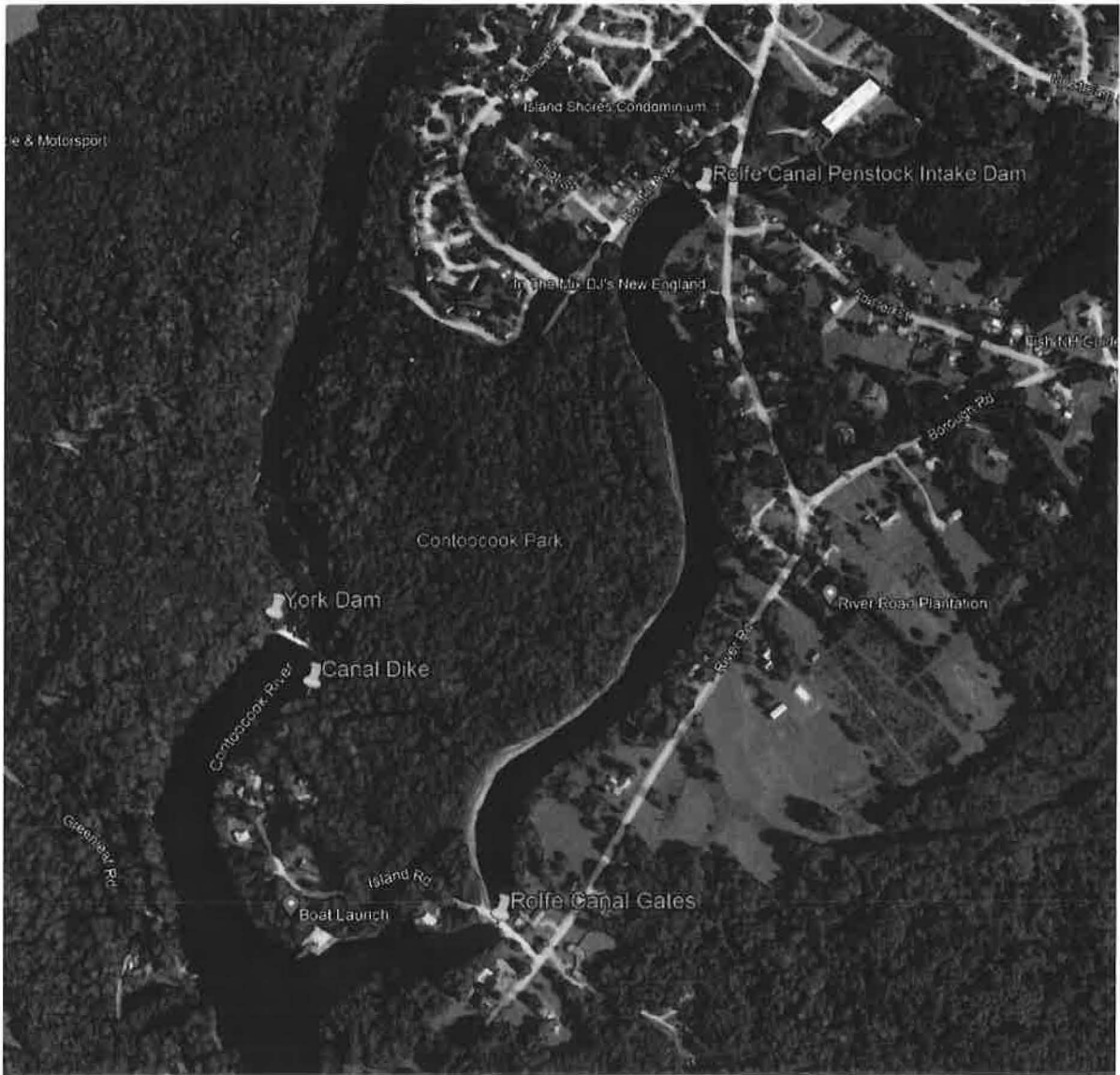
Figure 2. Location of Properties