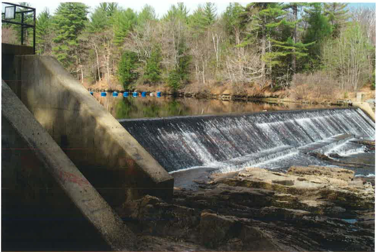
Figure 4. York Dam