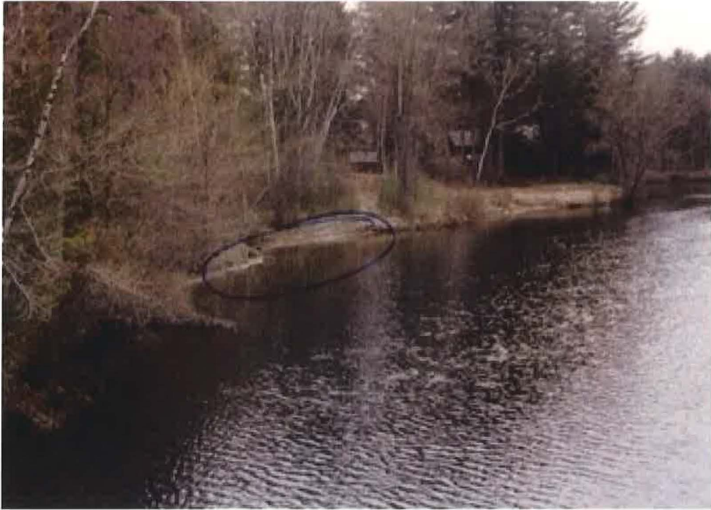
Figure 5. Canal Dike