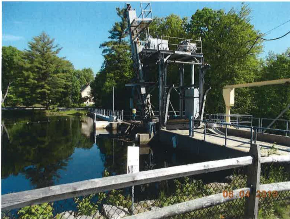
Figure 7. Rolfe Canal Penstock Intake Dam