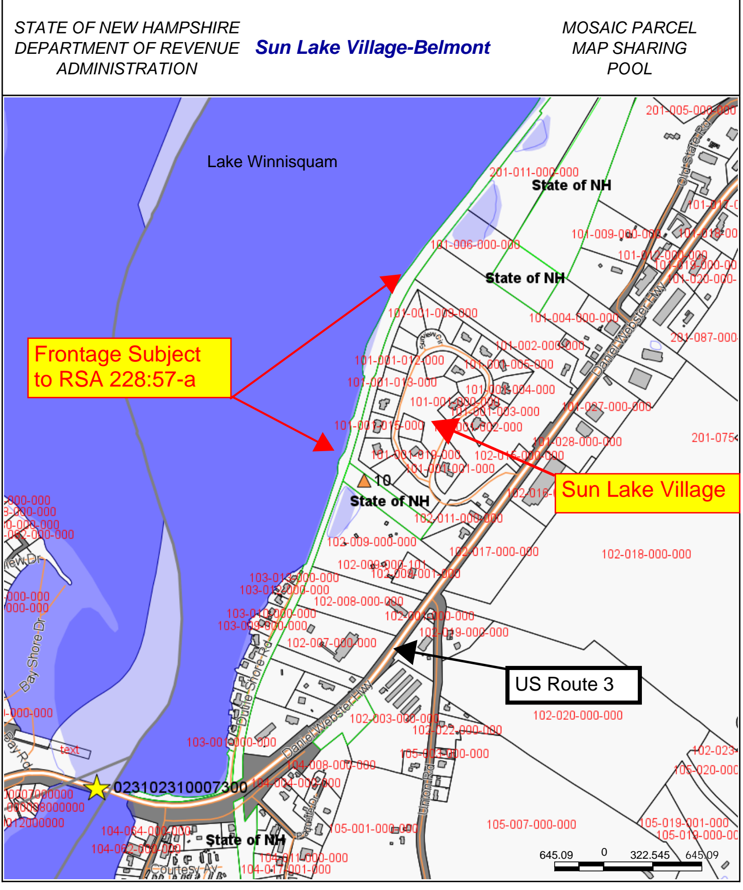
Prepared by NHDOT-Bureau of Rail & Transit